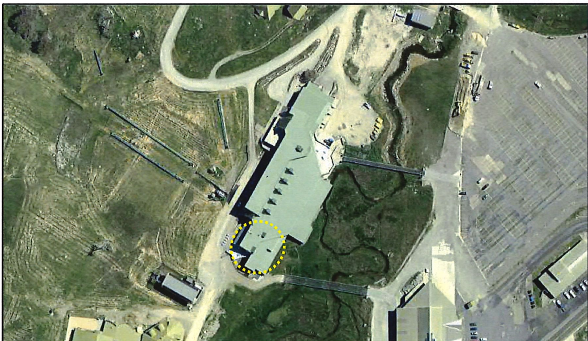
Figure 1: Jax Bar location within the Perisher Centre

This report provides an assessment of a Development Application (DA 9239) lodged by Perisher Blue Pty Ltd on 29 March 2018 under Part 4 of the Environmental Planning and Assessment Act, 1979 (EP&A Act). The application seeks consent for internal works to Jax Bar within the Perisher Centre, Perisher Range Alpine Resort within Kosciuszko National Park ( Figure 1 ). The proposal is described in detail in Section 2 of this report.